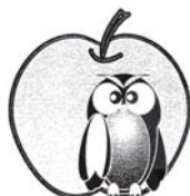
家長也敬師運動 Parents Also Appreciate Teachers Drive

(Chairperson) Committee on Home-School Co-operation